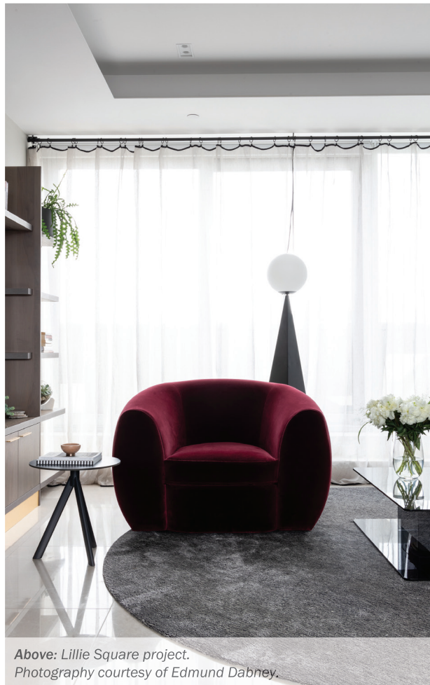
Above: Lillie Square project.