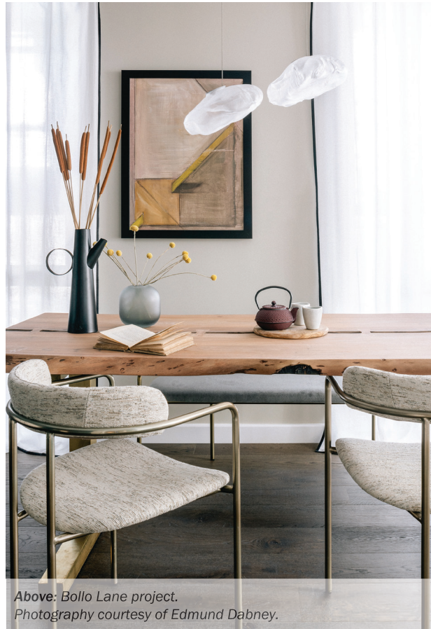
Above: Bollo Lane project.

For us, we note that private clients place great emphasis on storage. Hence we always create secret pockets of storage space in the pieces we make. All our beds have built-in storage; we add ottomans instead of coffee tables that double up as storage. Then we place a hand made timber tray on top to provide ottoman with a solid finish. We think ahead about the usage of pieces, such as including cable management solutions. The most important question we ask our clients is how will their space be used. There is a considerable difference in designing for a family to a show home, so this question is vital in understanding what is being asked of us. Recently we worked on a show home that wasn't working for the developer. They wanted us to reuse as much as possible. The brief was to lift the space, make it more homely and luxurious, the budget was limited, and we were