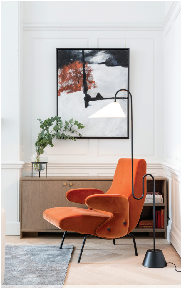
Southampton St project

in Covent Garden. These wonderful, luxurious apartments have dark floors, dark kitchens and heavy stone bathrooms. To soften the space, we introduced lightness through organically shaped furniture, like curved sofas. To create a homely feel, we steered clear of attention-seeking colours, instead using unsaturated earthy tones and silk and velvet textures for the rug and cushions. Just a door down, on Southampton Street, we